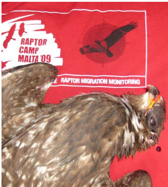
A shot Honey Buzzard received during autumn 2009.

Furthermore, as it takes several years for the young of many of these species to reach sexual maturity, they have to survive several migrations before they are of a sufficient age to successfully breed. The chances of survival to breeding age of those birds having to pass repeatedly over Malta are therefore affected by the high levels of illegal hunting pressure. Ring recoveries of birds ringed as nestlings and killed in Malta include Pallid Harrier (Globally Near Threatened, Endangered in Europe with a breeding population of 5-51pairs), Osprey (Unfavourable Conservation Status, Rare), Lesser Kestrel (Global Status Vulnerable), Saker Falcon (Globally Endangered, entire European population 360-540 pairs) and Purple Heron (Unfavourable Conservation Status, Declining) 2 .