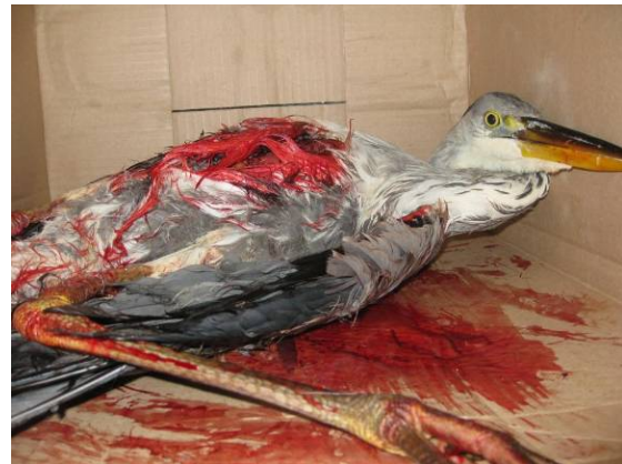
A Grey Heron with severe gunshot wounds, found by police on 17 th September 2009.

Since 2007, BirdLife Malta has been keeping a centralised database on illegal hunting and trapping incidents witnessed by BirdLife Malta staff, ornithologists, volunteers and members of the public known to the organisation. Other reports from unknown individuals and hearsay reports are not included in this database. An analysis of the database is published annually.