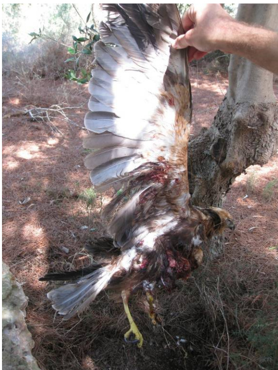
A freshly shot Marsh Harrier found hidden under a stone in Mizieb woodland on 20 th September 2009.

organisation that runs a separate camp than BirdLife's Raptor Camp) volunteers found the largest single incident of wild bird crime in Malta in the recent history. On the 20 th and 21 st of September, the remains of over 200 protected birds were found hidden in an area of the Mizieb woodland , which the FKNK claims to manage this public land as a hunting reserve for some of its members.