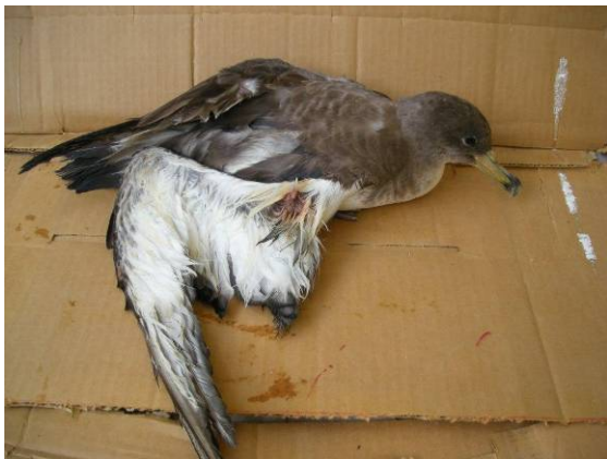
A Cory's Shearwater with extensive gunshot injuries to its wing, found at sea off Gnejna (Gozo) on 15 th August 2009.

The most common shot protected birds received by the organisation include Marsh Harrier Circus aeruginosus , Common Kestrel Falco tinnunculus and Honey-buzzard Pernis apivorus , as well as Red-listed species such as the Pallid Harrier (IUCN Red List: Endangered) and Annex 1 species including Purple Heron Ardea purpurea , Night Heron Nycticorax nycticorax , Lesser Kestrel Falco naumanni and Cory's Shearwater Calonectris diomedea .