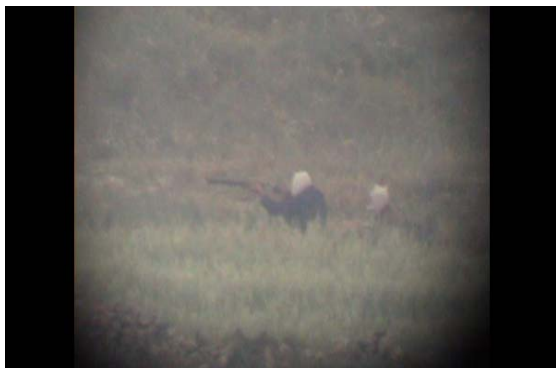
Two poachers, one of whom was later identified as a policeman, shooting out of season in Gozo on the 18 th April 2008. Both individuals were wearing balaclavas to conceal their identity.

force and that they do not feel that the police will arrest these individuals. In some cases, members of the public claim that the poachers themselves are police or are relatives of the police. While this cannot normally be verified, on the 18 th of April 2008, a BirdLife Malta Spring Watch team in Gozo filmed two poachers hunting in the closed season and wearing balaclavas to conceal their identity. When the poachers were apprehended, one was identified as a policeman from Malta. The case is on-going.