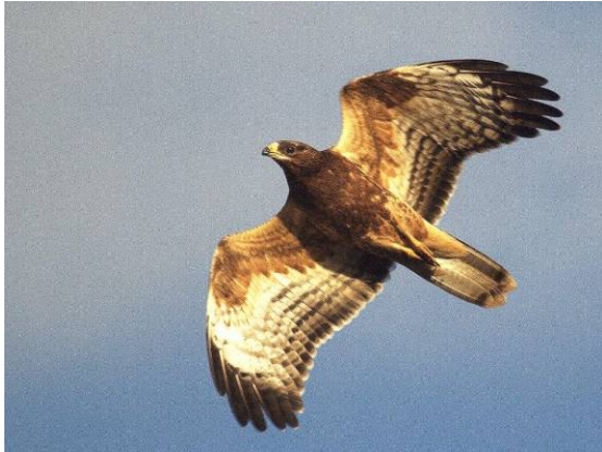
A Honey-buzzard, one of the most common migratory birds of prey in Malta.

and 4,616 licensed trappers. This gives a density of around 47 hunters and trappers per square kilometre, which is significantly higher when compared to a density of 2.5 hunters per square kilometre in Italy - another country in the Mediterranean with large numbers of registered hunters.